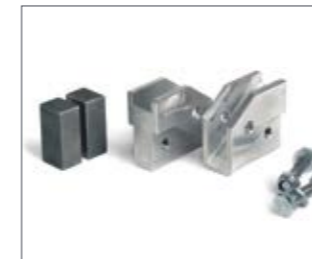
TYP | TYPE 05

Mit Verlängerung für den Seitenständer | With stand extensions