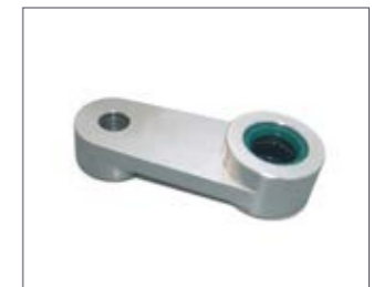
TYP | TYPE 09