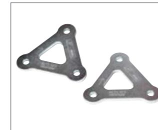
TYP | TYPE 01