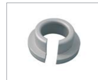
TYP | TYPE 10