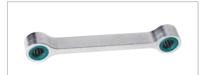
TYP | TYPE 06

Mit Verlängerung für den Seitenständer | With stand extensions