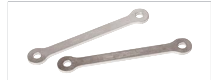
TYP | TYPE 03