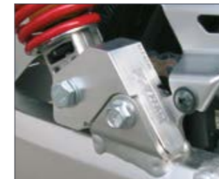
TYP | TYPE 04

Mit Verlängerung für den Seitenständer | With stand extensions