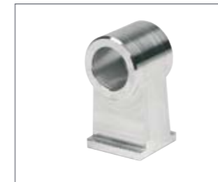
TYP | TYPE 02