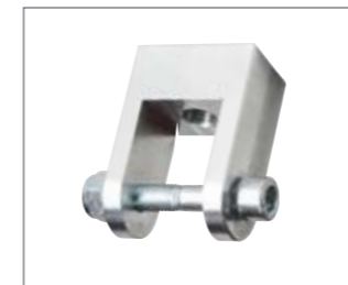
TYP | TYPE 07

Mit abgedichteten Nadelhülsen, die über eine hohe Tragfähigkeit verfügen | With high load capacity sealed needle roller bearings